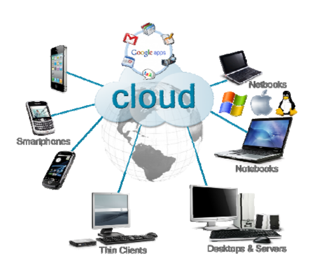
Figure 1.Cloud Overview Diagram